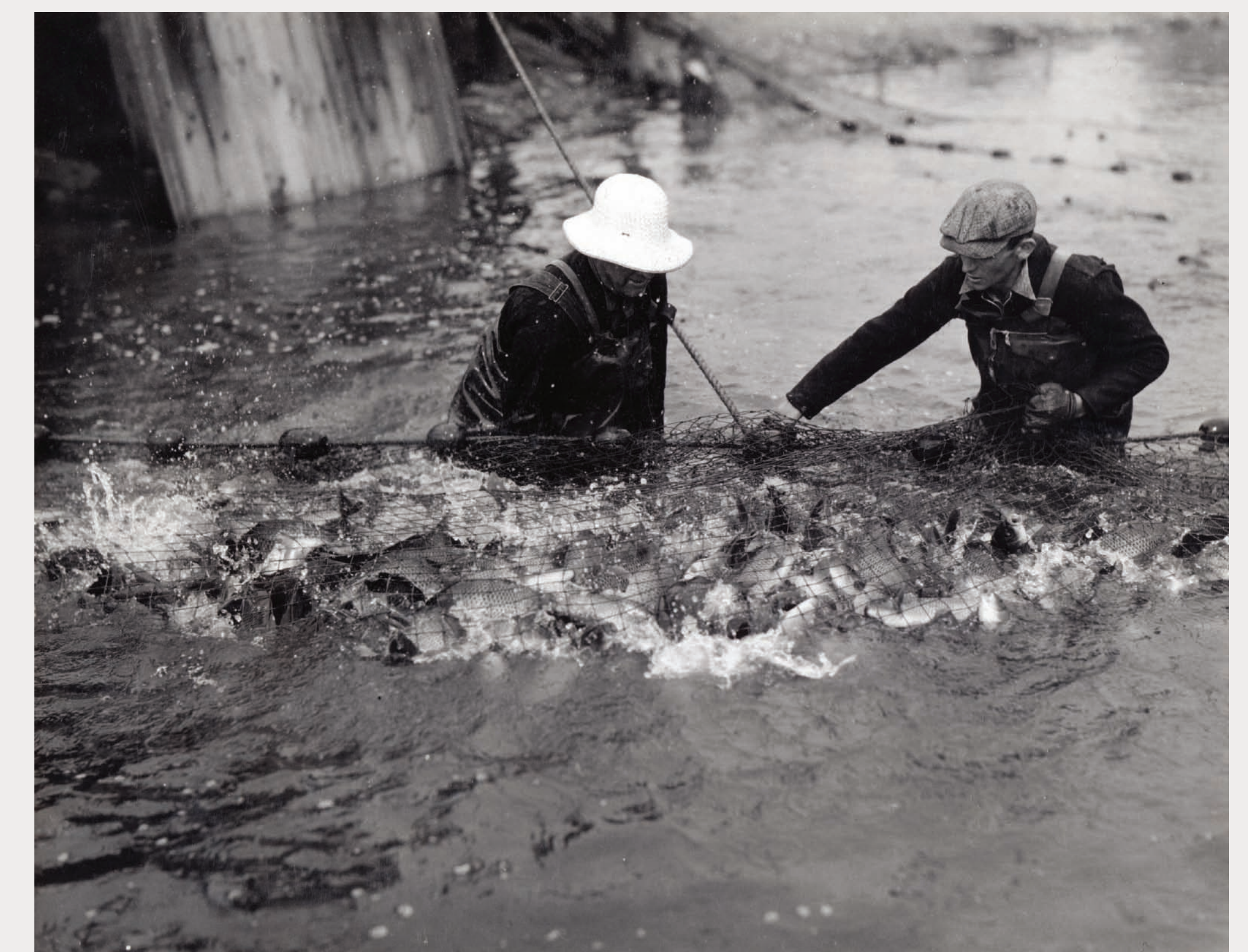
Above: Pulling in the lead line on Lake Kegonsa, November 1934. Above right, top to bottom: Moving carp from holding pen to fish box. Barge pulling in seine on Lake Waubesa, motor-driven winch in middle of boat. Removing carp by seine net from holding pen for shipment, Lake Kegonsa.