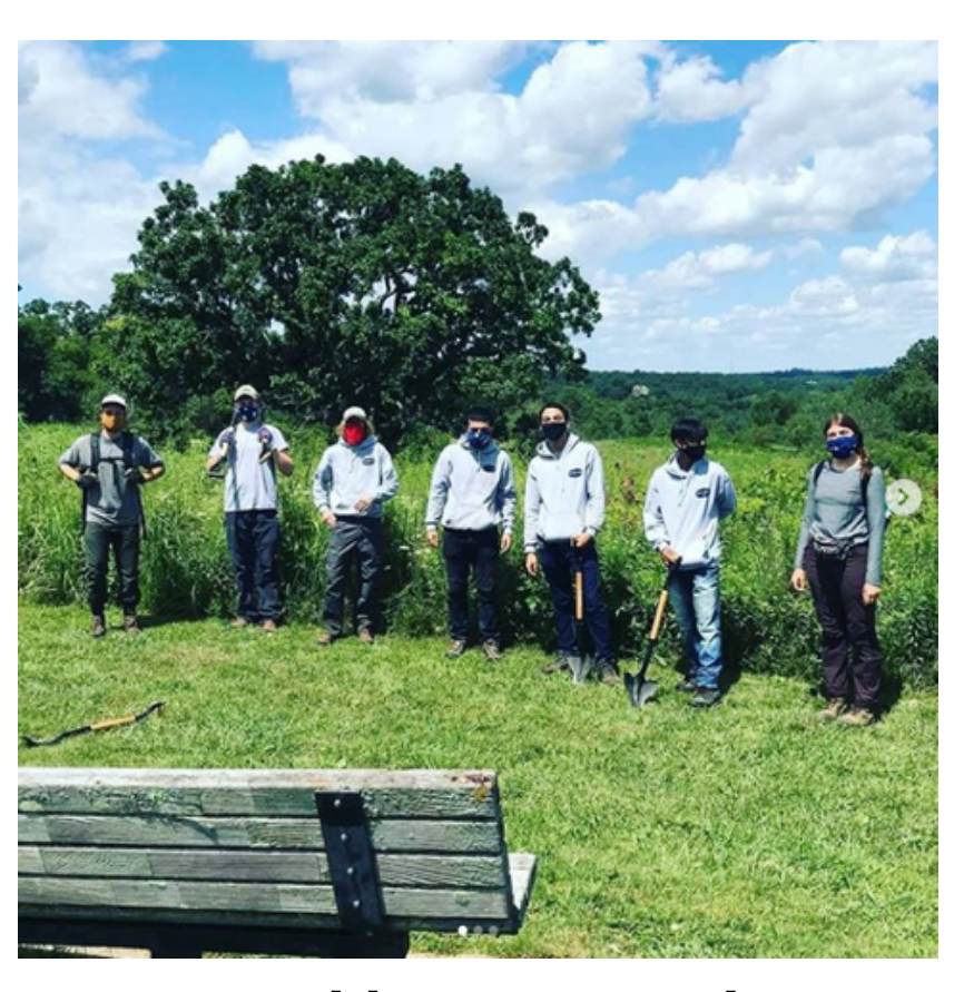
Donald County Park @ofsmadison