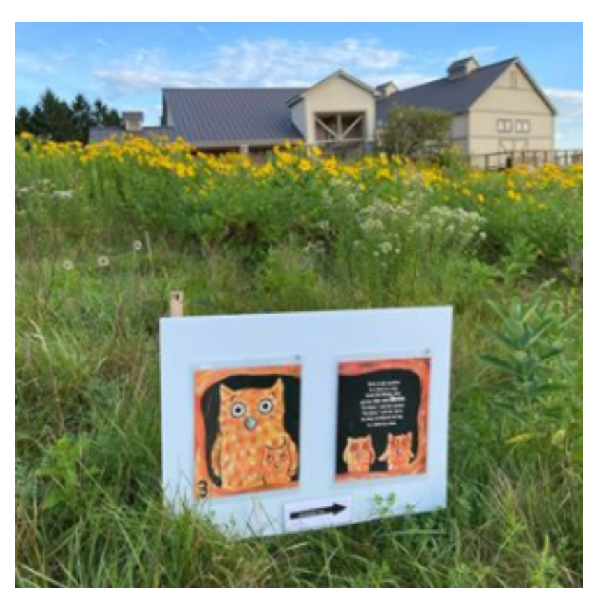
Lussier Family Heritage Center @lussierheritagecenter

Share your photos with us #danecountyparks