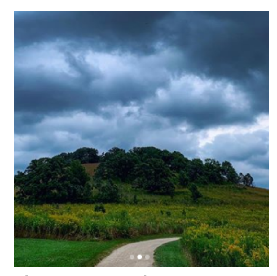
Pheasant Branch Conservancy