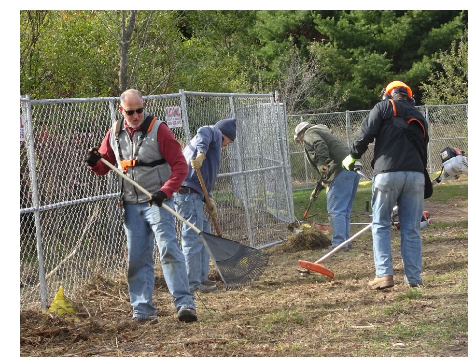
Learn more about this project on our website!