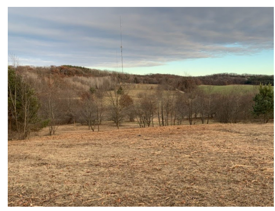
View of the terminal moraine before and after removing invasives