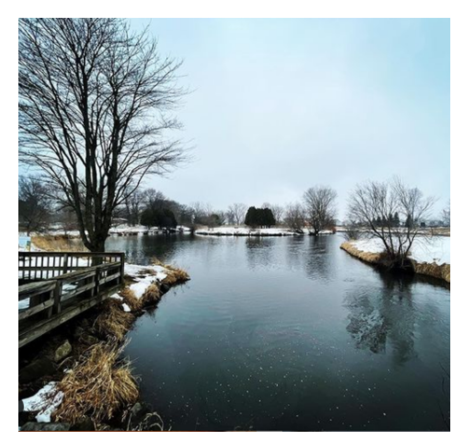
Token Creek County Park @officetooutdoorsblog