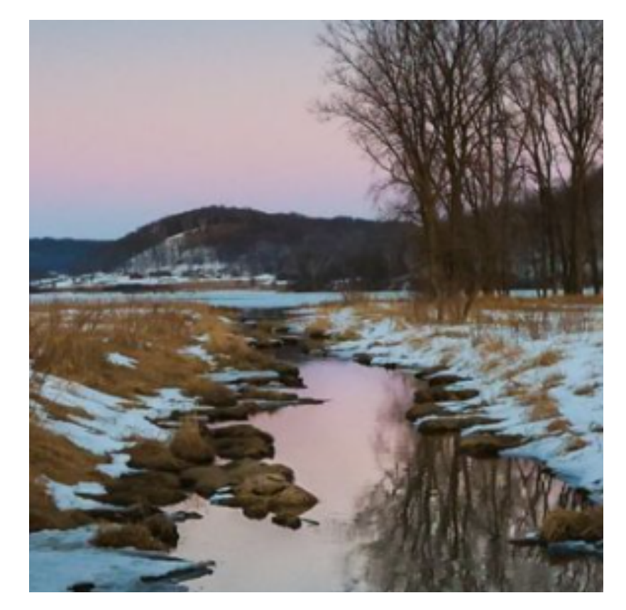
Indian Lake County Park @jmzpics