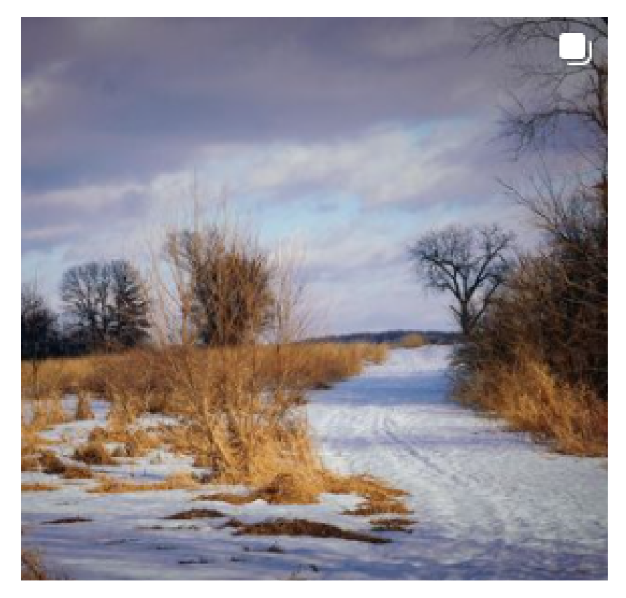
Walking Iron Wildlife Area @raffel921