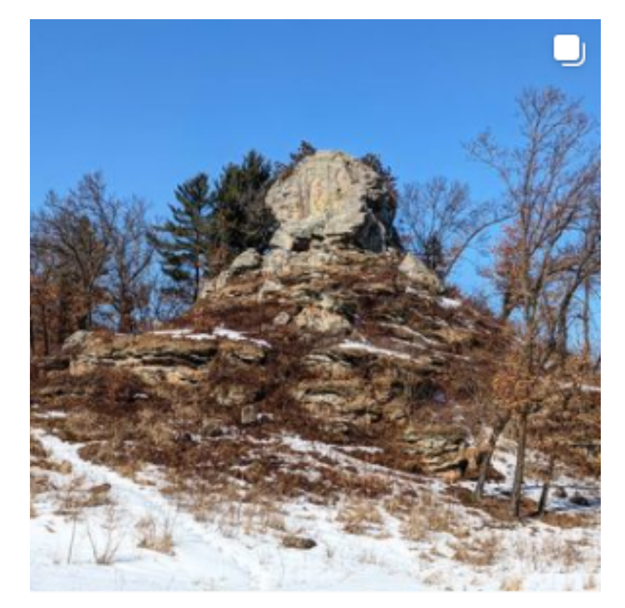
Donald County Park @eboyd0012