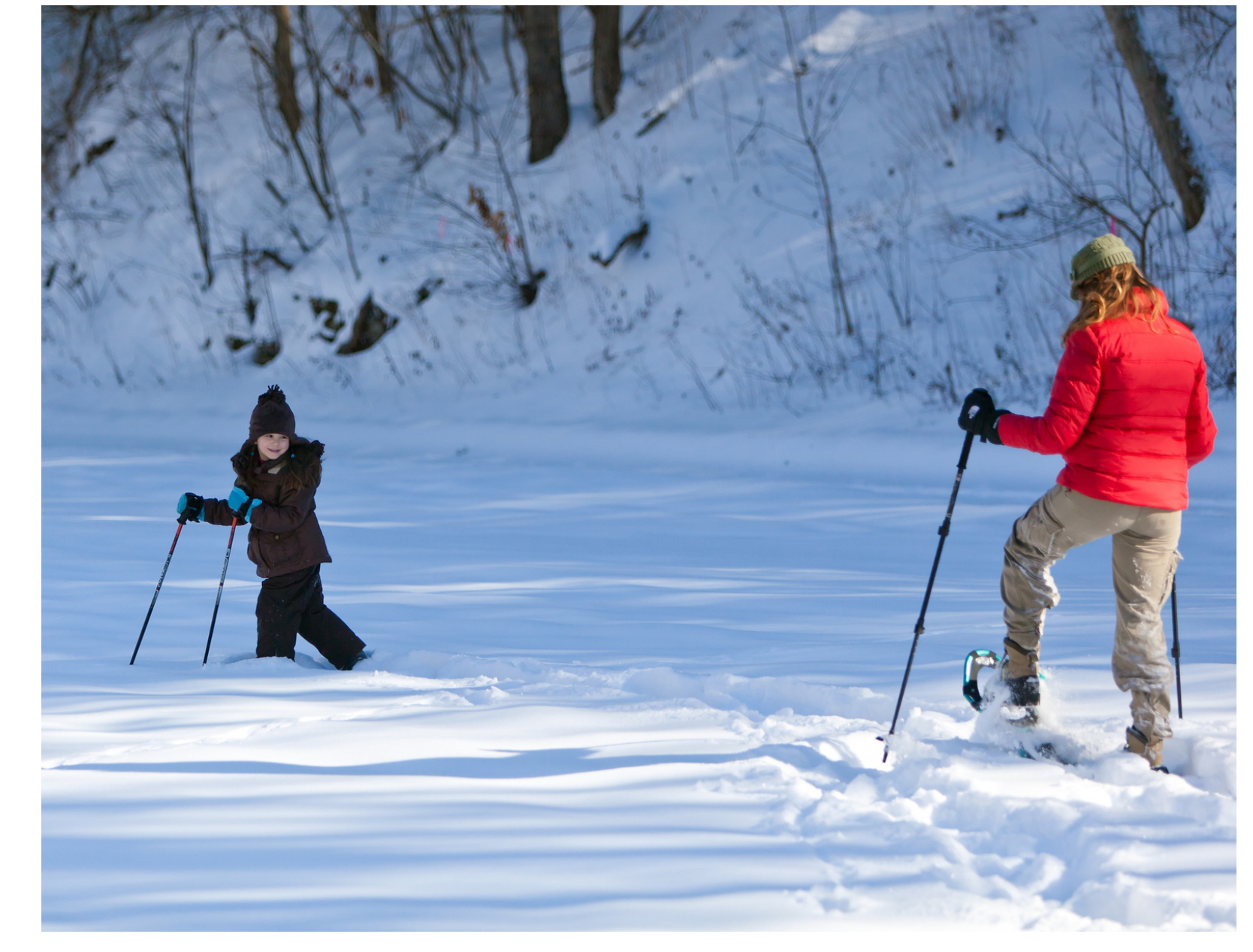
Stewart Lake County Park

Please remember that snowshoeing, winter hiking and dogs are NOT allowed on groomed cross-country ski trails.