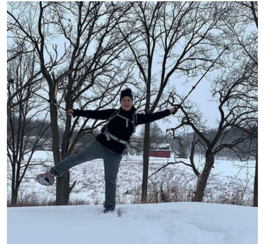
Donald County Park @lisa.salsa

Tag us in your adventures @danecountyparks