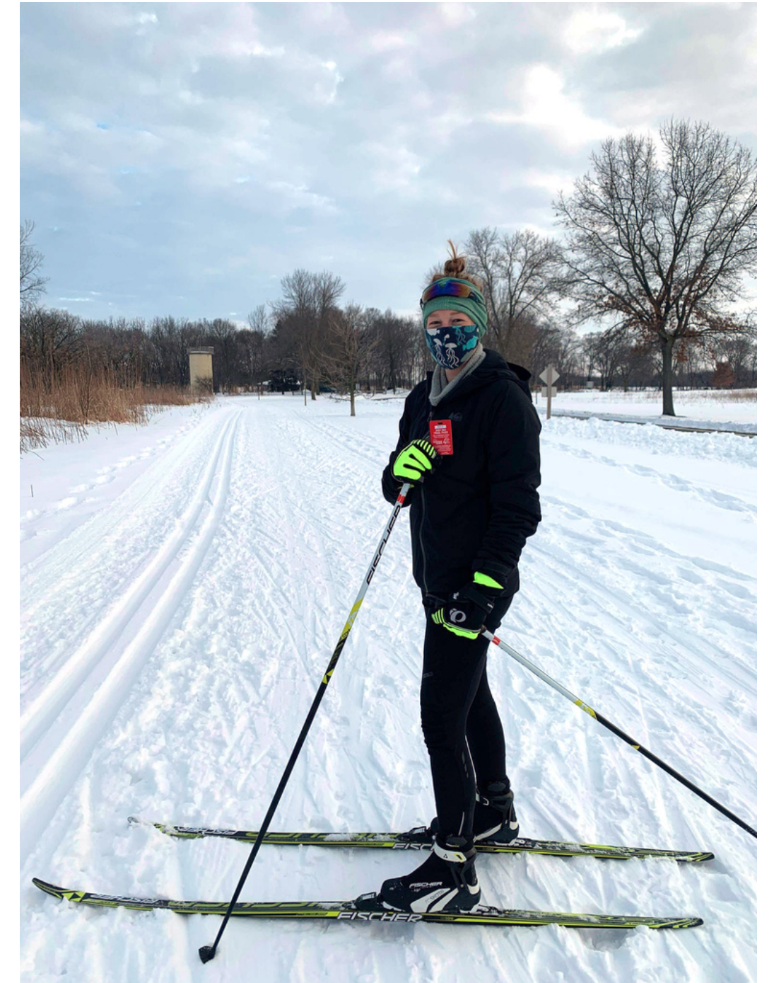
William G. Lunney Lake Farm County Park