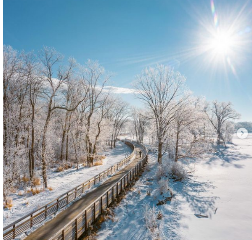
Lower Yahara River Trail @kule_wege