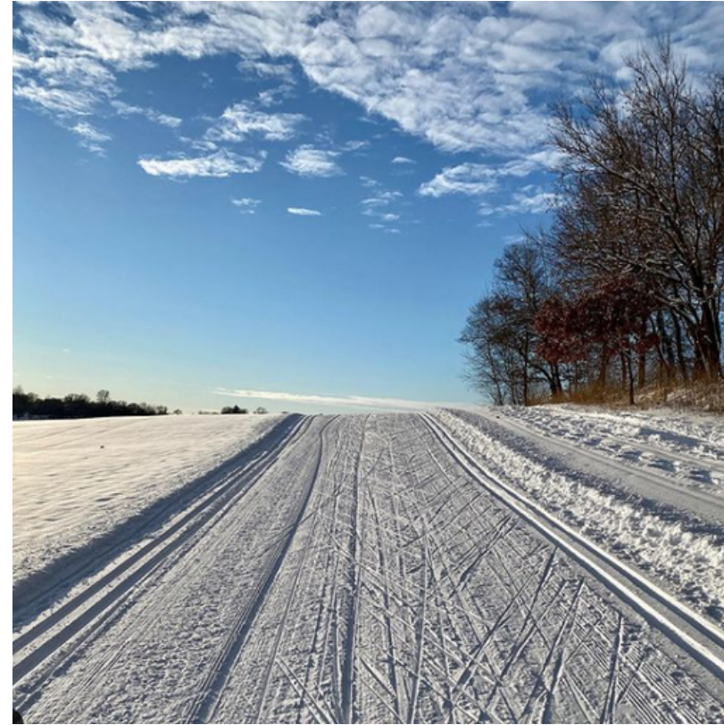
McCarthy Youth and Conservation Park @midwestski