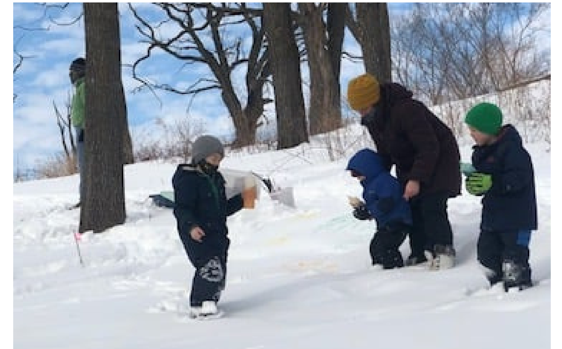
Stewart Lake County Park