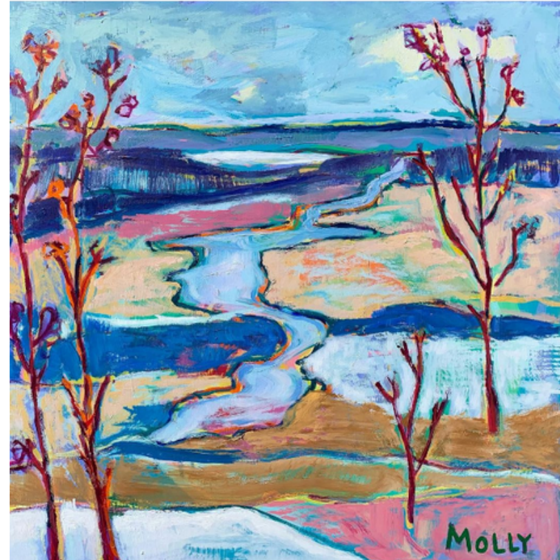
Pheasant Branch Conservancy @mollykrolczykpaintings