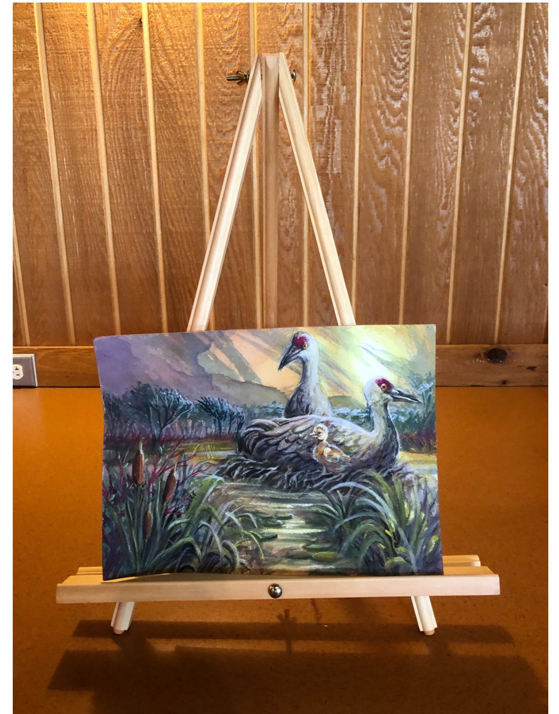
2020 First Place Winner