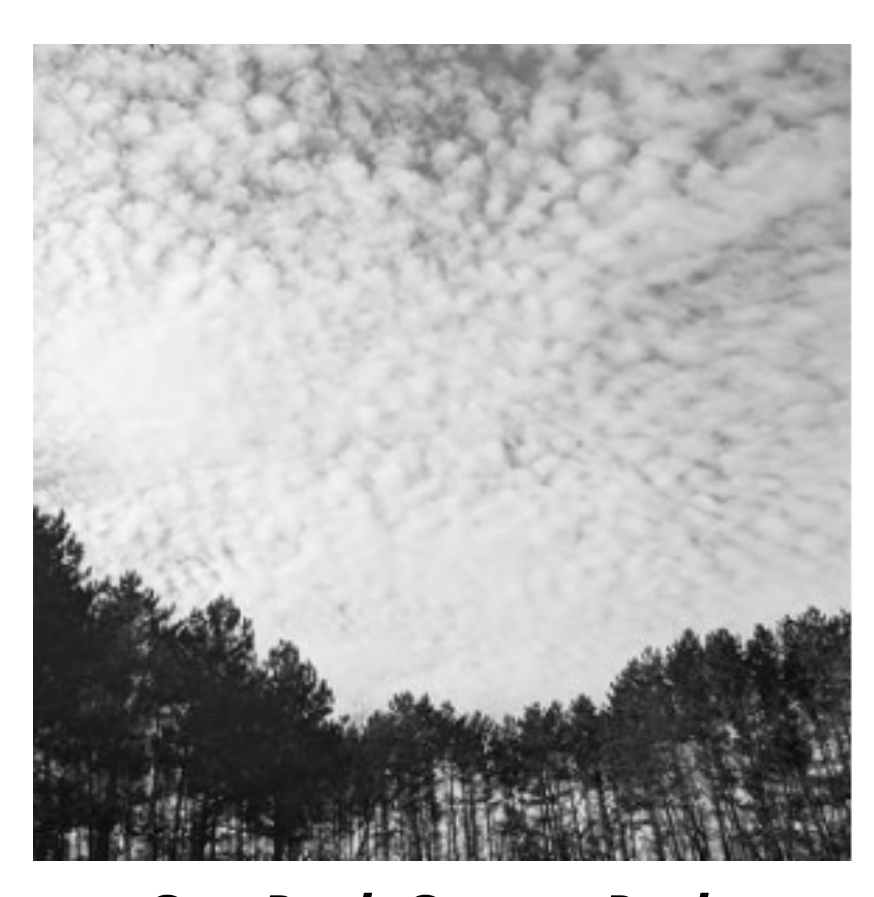
CamRock County Park