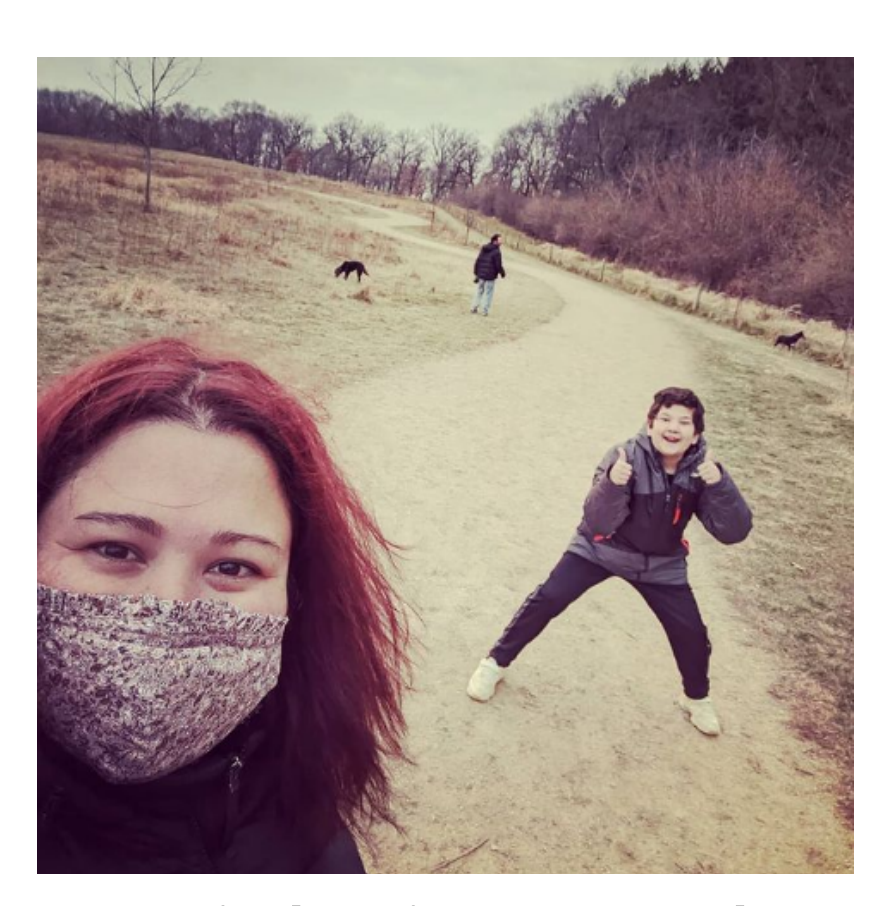
Capital Springs Dog Park @ceciliagillhouse