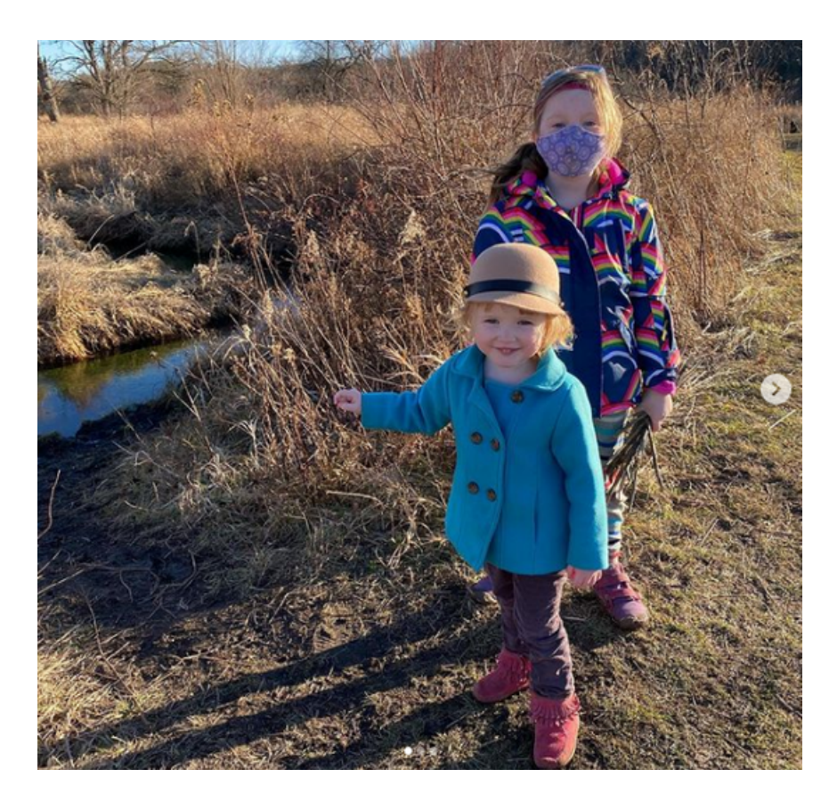
Donald County Park @keldaroys