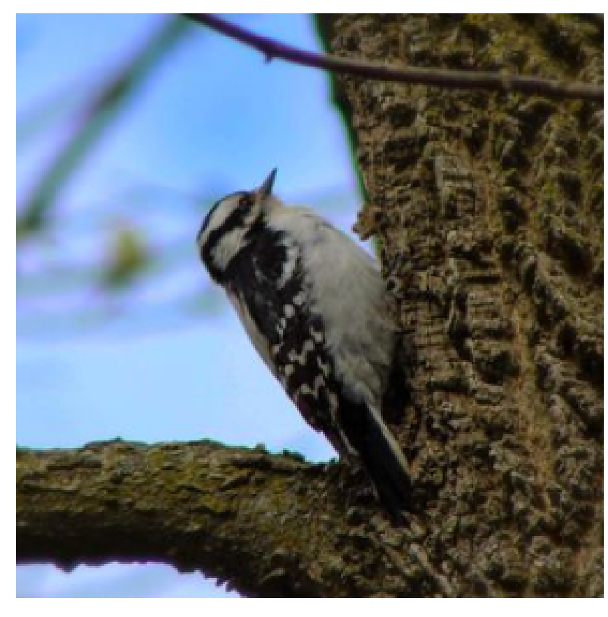
Lunney Lake Farm County Park @lussierheritagecenter

Tag us in your adventures edanecountyparks